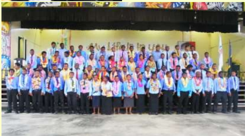
Left: Entire group of graduating students 2011