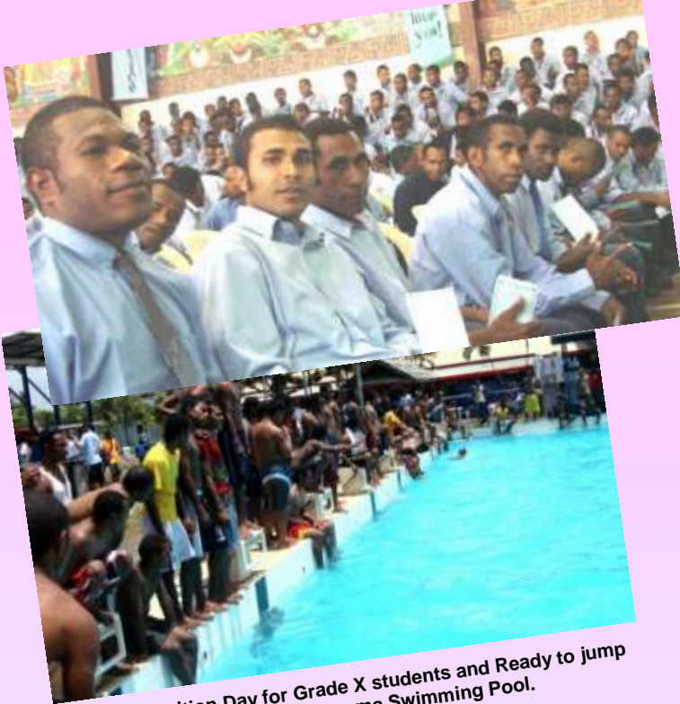
Left: Recognition Day for Grade X students and Ready to jump into the cool waters at the Taurama Swimming Pool.