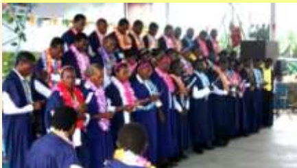
Graduates sing - 'Bosconians Forever'

token of appreciation from the school. A delicious lunch was offered to the graduates, guests, parents and friends. Everyone enjoyed a healthy shared meal prepared by the school and the parents of the graduates. A live entertainment followed. It was truly a blessed day for the school to witness yet again another batch of Bosconians from all over the country graduate from a Don Bosco School. All departed rejoicing.